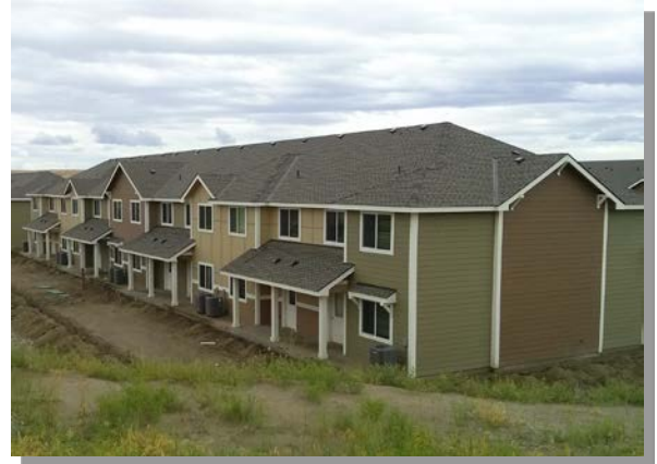
Progress Construction Photo