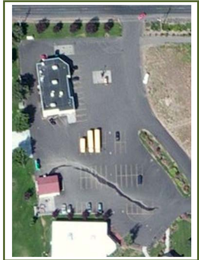
Existing Project Area Aerial

The property Owner asked DLC Architecture to explore design solutions to improve traffic safety at the main entrance to the property and at the commercial areas adjacent to the existing market and deli, laundry facilities and elementary school and chapel. The wide open vehicular circulation and maneuvering areas are a cause of concern for safety of this traffic as well as pedestrians. The Owner also asked to explore if it was possible to increase the number of overall parking spaces. A conceptual layout was provided to address the vehicle circulation and maneuvering areas as well as increase the number of overall parking spaces. The turn-around at the school was maintained as a student drop of area as well as providing for semi-truck access and maneuvering around the market and deli to accommodate deliveries. Pedestrian walkways were also provided adjacent to proposed landscape islands.