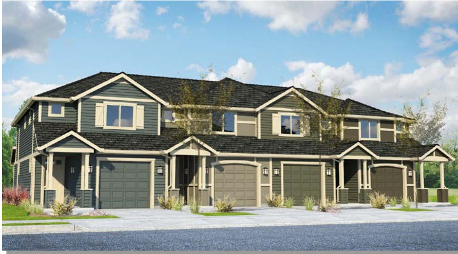
Design Rendering- Front Elevation