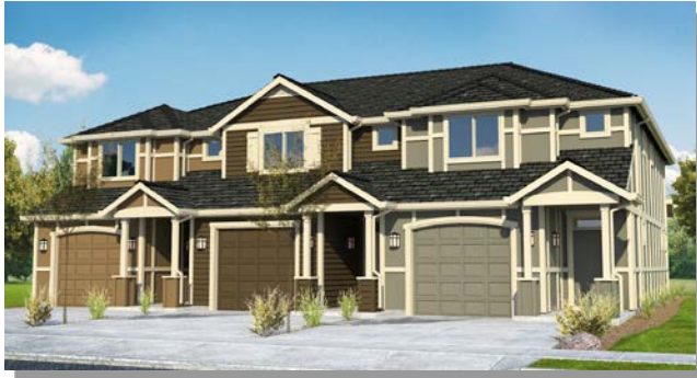
Design Rendering- Front Elevation