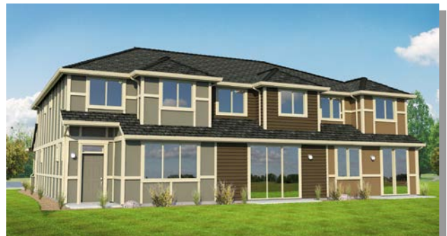
Design Rendering- Rear Elevation

The main floors are designed with "great-room" open floor layout where kitchen is open to main living area. Stair is located in center of unit behind garage for center circulation. Upper floor has a master suite, with 2 additional bedrooms and a separate laundry room.