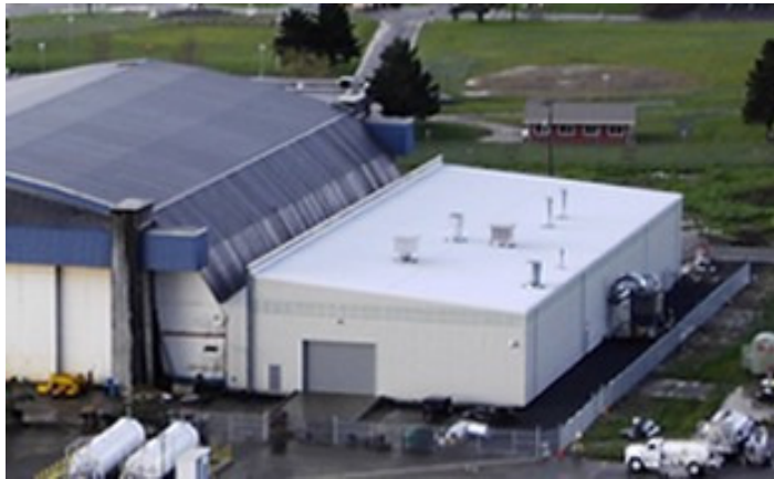
Aerial View of Addition

Project Description: Engineered metal building addition to existing manufacturing facility to accommodate building industrial vehicles and electric aircraft tugs. Addition spaces included paint booths, work areas, storage areas, line-x application and sand blast rooms.