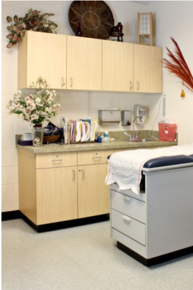
NorthStar Clinic- Exam Room