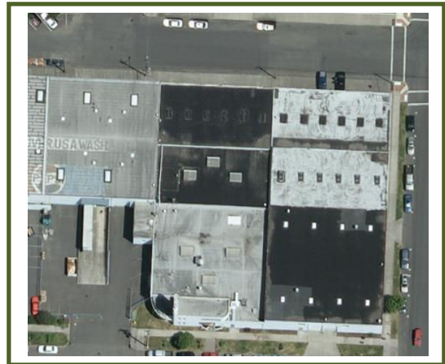
Aerial of Existing Building