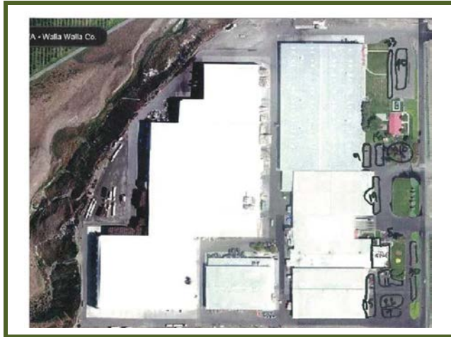
Site Aerial Photo